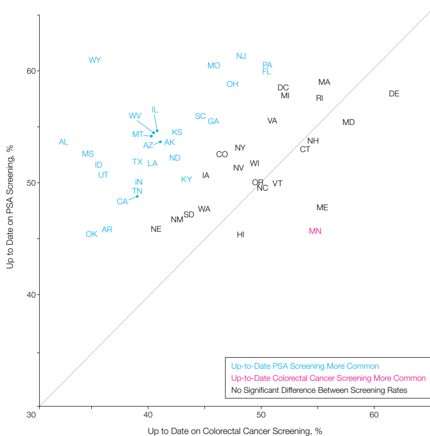
Figure 2. Relationship Between Up-to-Date Prostate-Specific Antigen (PSA) and Colorectal Cancer Screening Among Men Aged 50 to 69 Years by State

Prostate-specific antigen (PSA) screening is more common than colorectal cancer screening in the portion of the graph above the dotted line. The color of the state abbreviation shows the statistical relationship between the state's PSA and colorectal cancer screening rates.